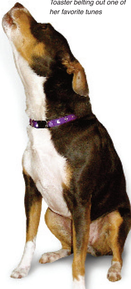
Toaster belting out one of her favorite tunes